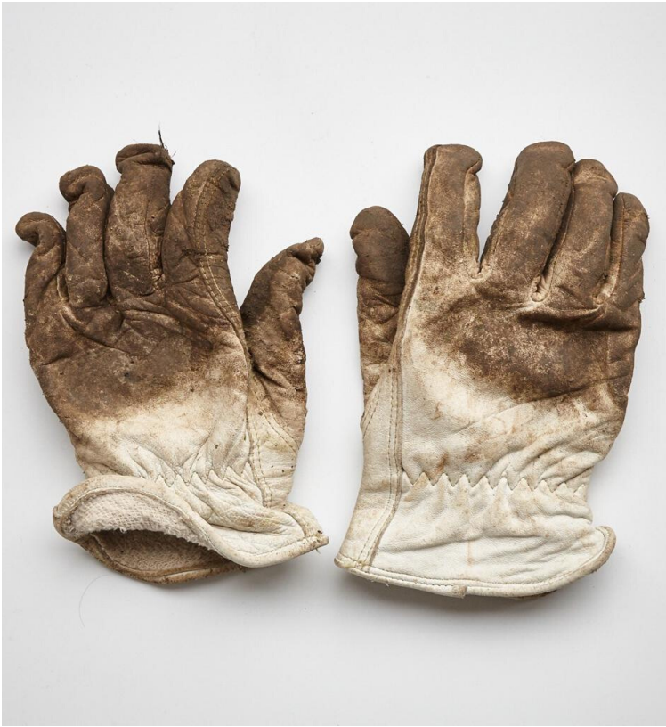
Gardening Gloves, Tessa Hallmann

WE NEED YOU!!! We have started collecting objects and stories about living through COVID-19. We want to collect your stories and a significant object that represents your experience of living through these really challenging and unique times. We will not have room for everyone's objects in our store, however we would like to continue collecting stories and significant objects digitally once we have allotted space for all the physical donations. We will eventually showcase all the physical and digital objects in a new display that explores the significant and very personal experience of living through a pandemic, in particular how this has affected our town and community. If you would like to share your story please send an email to museums@southend.gov.uk containing an image of the object you wish to donate and a short story about why this object is significant to you, how it links to these strange times that we are all living through, along with your name, age, and where you live. The cut-off deadline for this call-out will be the 30th of June.