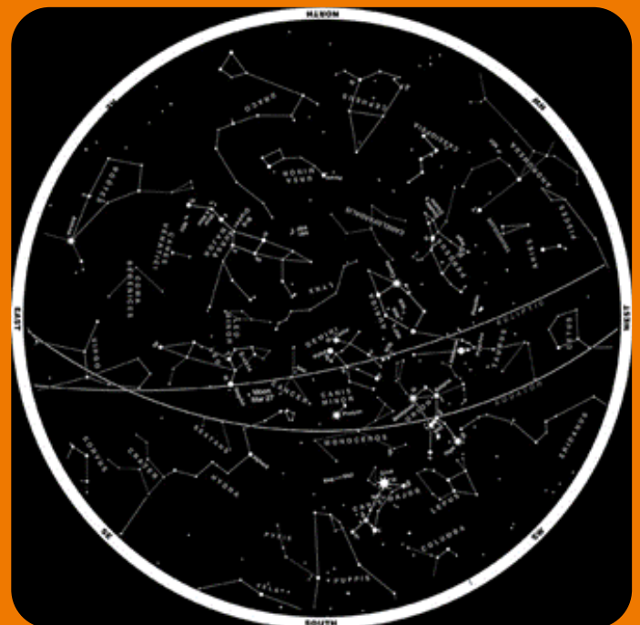
Southern Constellations Map © NASA

For an immersive look into constellations & other night sky objects - book a planetarium show by giving us a call on 01702 212345.