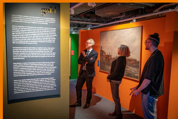
Lord Parkinson visiting Beecroft Art Gallery