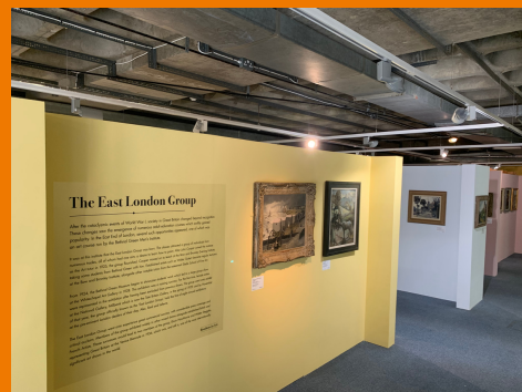
Brothers in Art, Beecroft Art Gallery

To mark English Tourism Week Lord Parkinson paid visit to our Beecroft Art Gallery to see the exhibition. Lord Parkinson, who was visiting Southend for the first time, talked to us about his passion for art and found the exhibition to be 'superb'.