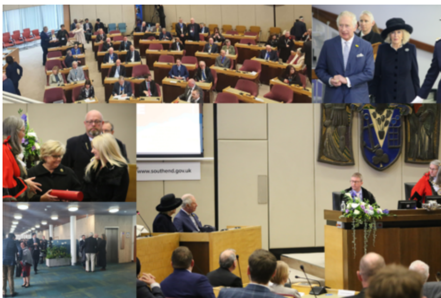
Images from City Day, Tuesday 1st March 2022.

Photos from Southend-on-Sea City Council